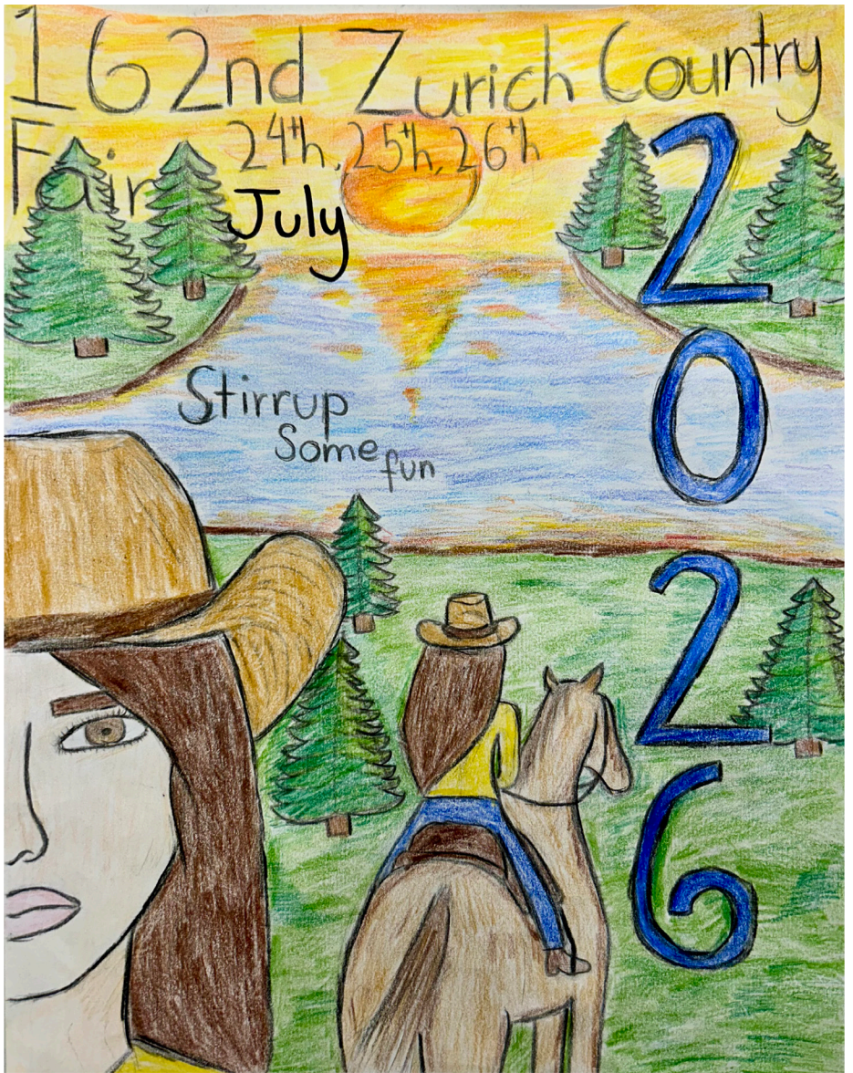
Cover by: LJ P.